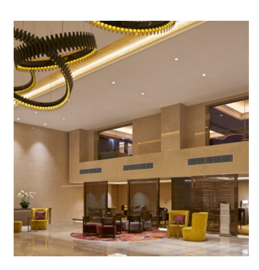
HOLIDAY INN GOLDEN MILE HONG KONG